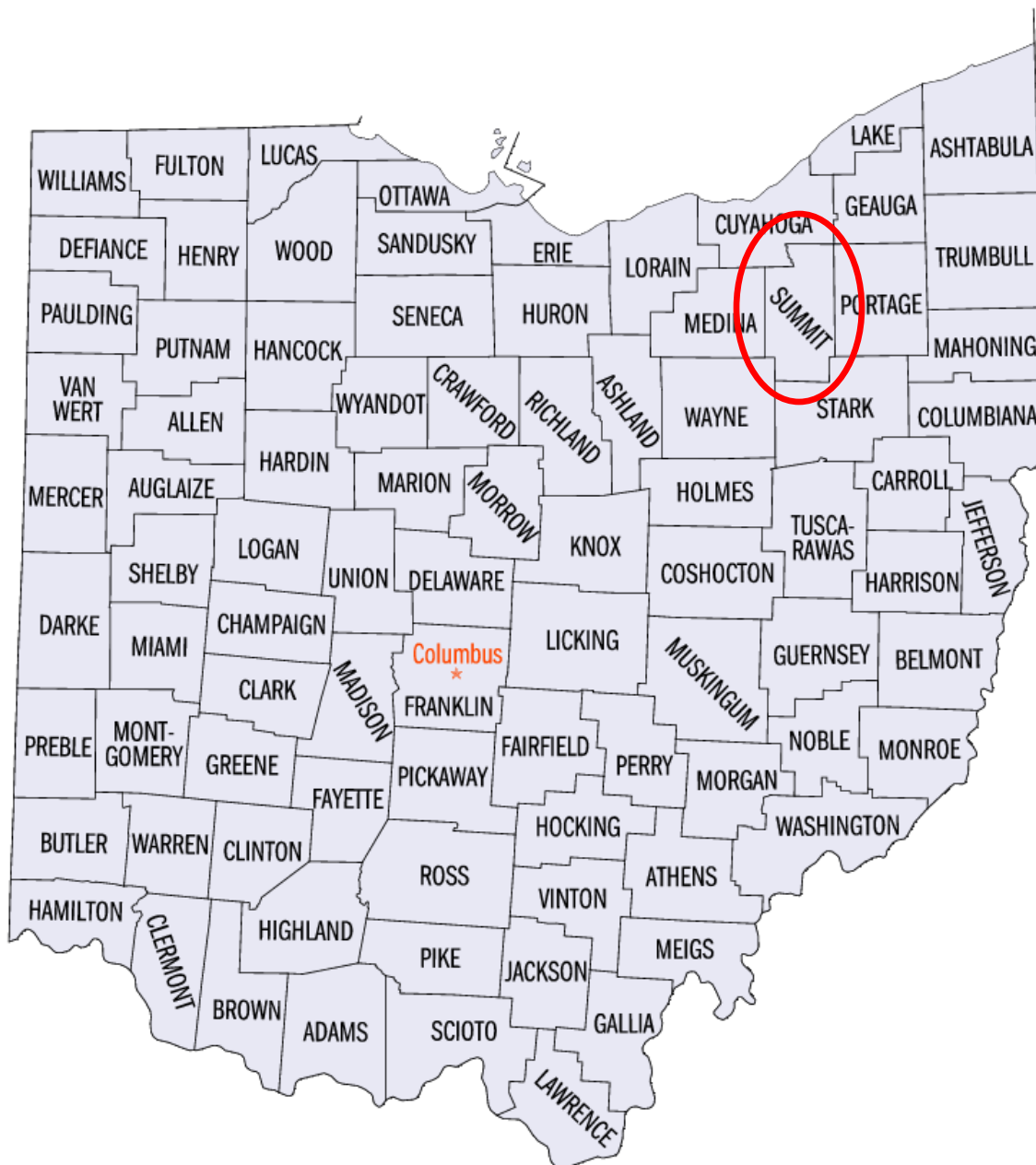
Exhibit A: County Map of Ohio